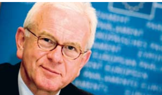
Hans-Gert Pöttering , a politician from the German CDU, is the President of the European Parliament

But, greater efficiencies in the use of fossil fuels and mandated global warming gas reductions, by themselves, are not enough to address the unprecedented crisis of global warming and global peak oil and gas production. The G8 nations have already agreed that overall global emissions of greenhouse gases will need to be cut by 50 percent by 2050, which will require that the industrial nations cut their emissions by 80 to 90 percent. Looking to the future, every government will need to explore new energy paths and establish new economic models with the goal of reducing global warming emissions. The industrial nations will need to achieve as close to zero carbon emissions as possible.