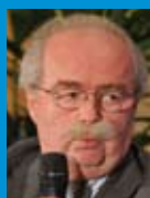
Christophe de Margerie Chief Executive Officer of Total