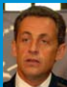
Nicolas Sarkozy French President

Recent contributors to Friends of Europe's activities include: