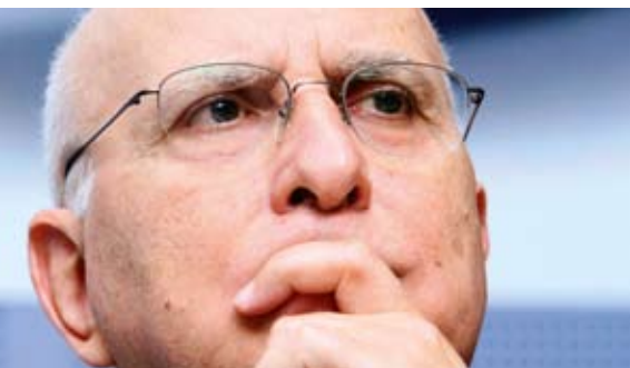
Stavros Dimas is European Commissioner for the Environment

In 2008, Daimler and RWE, Germany's second largest power company, launched a project in Berlin to establish recharging points for electric Smart and Mercedes cars around the German capital. Renault-Nissan is readying a similar plan to provide a network of hundreds of thousands of battery charging points in Israel, Denmark and Portugal. The distributed electric power charging stations will be used to service Renault's all electric Mégane car. Toyota has joined