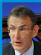
Andris Piebalgs EU Commissioner for Energy