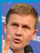
Erik Solheim Norwegian Minister for the Environment and International Development