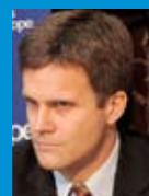
Helge Lund CEO of StatoilHydro