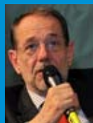
Javier Solana EU Representative for CFSP