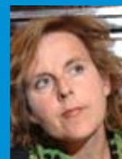
Connie Hedegaard Danish Minister for EU