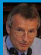
Martin Bartenstein