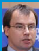
Gareth Thomas MP Parliamentary Under Secretary of State for the UK's Department for International Development (DFID)