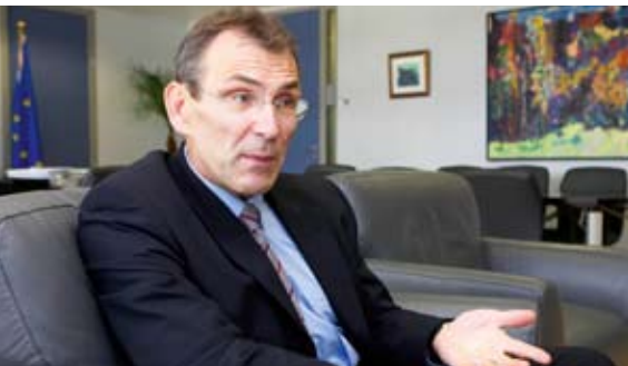
Andris Piebalgs is European Commissioner for Energy

We will need to educate our children to think as global citizens and prepare them for the historic transition from 20th century conventional geopolitics to 21st century global biosphere politics. Education will increasingly focus on both global responsibility to