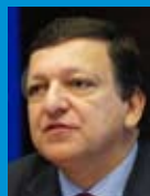
José Manuel Barroso European Commission President