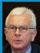
Hans-Gert Pöttering European Parliament President