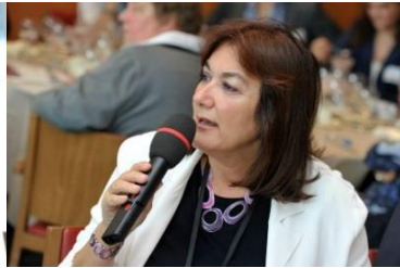
MEP D. Suica